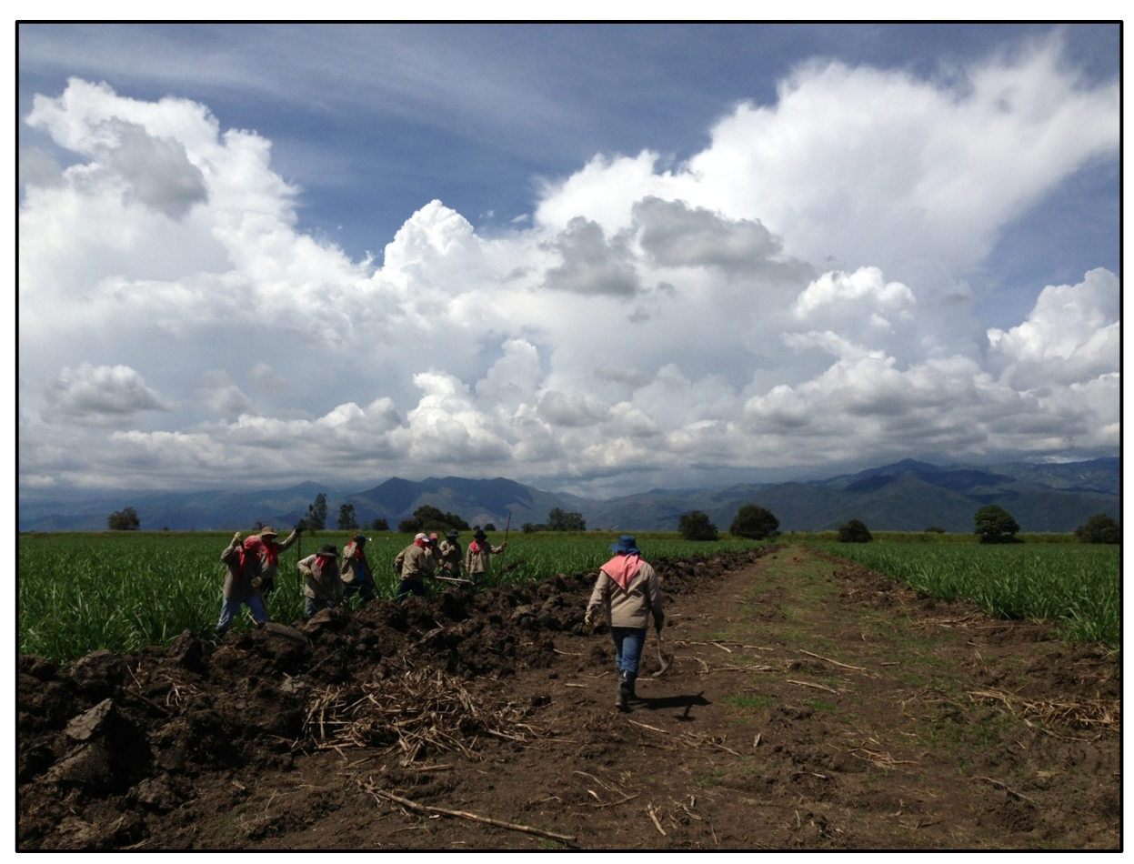
Workers in a sugar field in the Cauca Valley, Colombia.

They produce approximately 350 pounds of sugar for every metric ton of cane crop. Asocaña reported that sugarcane production for the sector in 2012 resulted in 2.3 million metric tons of sugar.