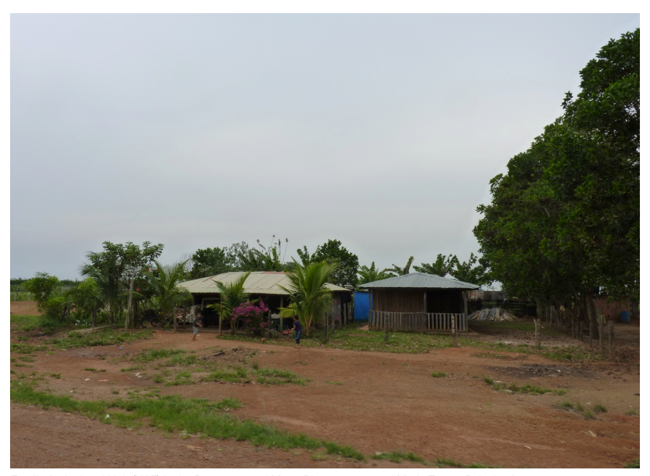
Family Agricultural Unit (UAF) in the Department of Meta.

The new land fund being established by the Colombian government as part of the National Development Plan 2014-2018 will, in part, be used to support current efforts in awarding and developing UAFs in the baldíos to small farmers and previously displaced persons.