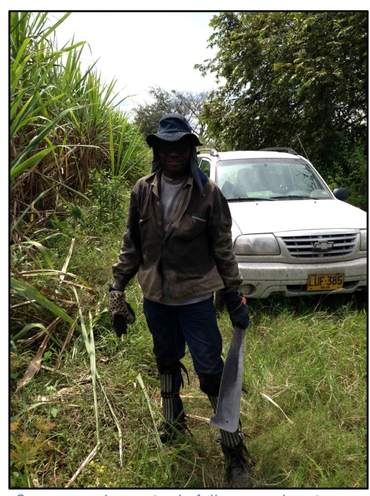
Sugar cane harvester in full personal protective equipment in the Cauca Valley, Colombia

In addition to the personal protective equipment, workers are provided